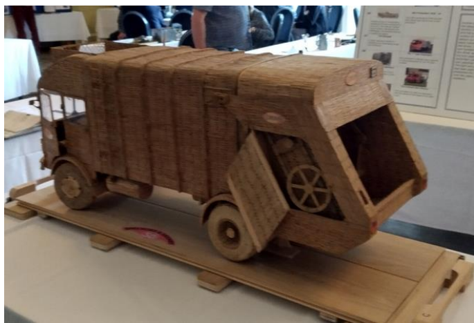
A TY Revopak with the early type driving mechanism for the tines.