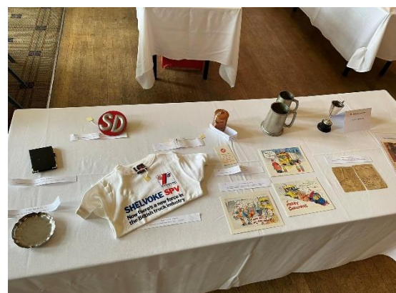
These items were loaned by the Garden City Collection.