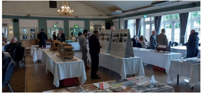
This photo is taken from the stage area looking towards the entrance to the Function Room.