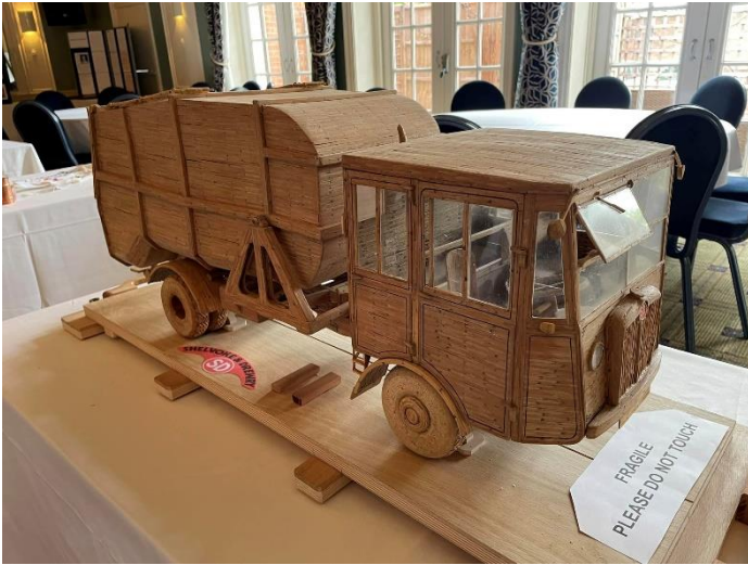
A 'W' type Fore & Aft tipper.