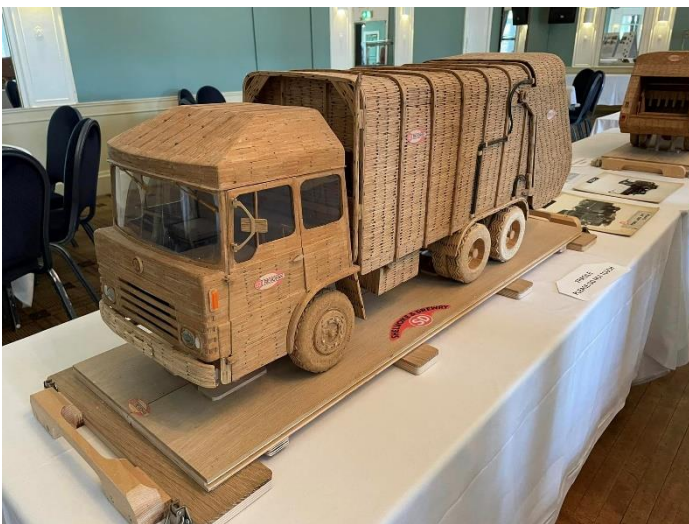
An NT (Triple axle) Revopak.