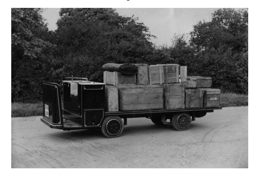
The very original S.D. Freighter, though in appearance possessing much in common with the works truck, is designed for road work at speeds up to 14 m.p.h., and its careful springing and weight distribution afford exceptionally easy riding, even over 'pot holey' roads

The S.D. Freighter can claim certainly to have originated an entirely new type of road vehicle. It takes its initials from its makers, Messrs. Shelvoke and Drewry Ltd., of Letchworth, who Christened it the "Freighter" on the grounds that the new type is to the 3 ton or 5 ton motor wagon what the freighter is to the liner. In its conditions and requirements road traffic varies so widely that development is pointing more and more towards specialised types, and, recognising this, the aim of the Freighter's originators has been the production of a vehicle easily handled in traffic by the most unskilled to the finest speed gradations, and lending itself in general to improved loading facilities.