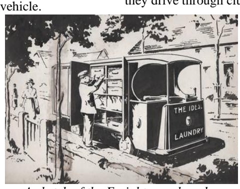
A sketch of the Freighter on laundry service