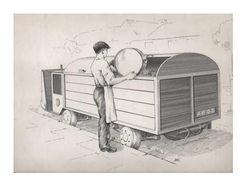
These sketches of the S.D. Freighter in service give an idea of the advantages claimed for specialised traffic.