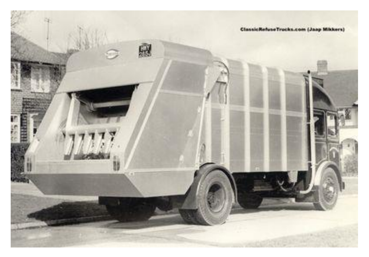
A 1970/71 TY Revopak.

The Revopak was launched at the Torbay Conference in June 1970. In December it was introduced to about 140 people engaged in the refuse collection business in North West England at the Norbreck Hotel in Blackpool. The event was reported in the 'Public Cleansing' magazine in February 1971.