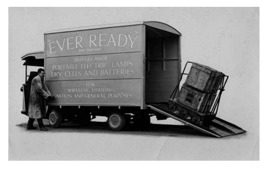
BOX VAN WITH WINCHES AND RAMP END. 10 ft. x 6 ft. 6ins. LOAD 2 tons. Price £640

In March Mike Mullarkey kindly sent me a number of SD related items. Among them was an A4 sized photocopied brochure with the title Freighters for Commercial Work. This has turned out to be a little gold mine. Initially I was a little confused as attached to the document were fourteen pages each with two photos of Freighters for refuse collection. Some of these have solid tyres, whilst some are on pneumatics. The main brochure is 27 pages with an additional price sheet. In the brochure all the Freighters have solid tyres. My guess is that the brochure dates from around 1926. Because of the limitations of photo copying the photos are not of sufficient quality to use here, so I have substituted photos from my files.