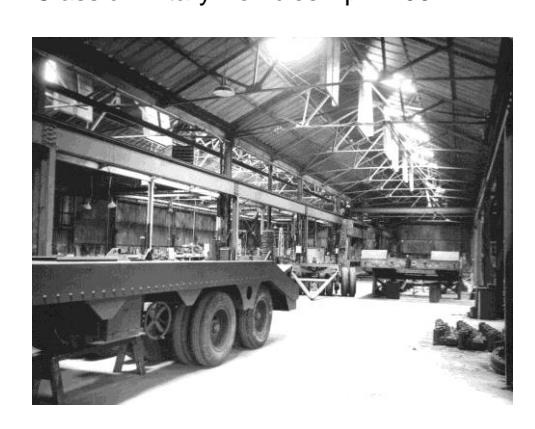
Trailers under construction.

After the initial order S&D received further orders for 120 30 ton tank transporters. An interesting footnote is that towards the end of the War the War Office tested a trailer with a 40 ton load and concluded that they could carry that load in an emergency. The photos are from those rescued from a recycling centre and the information is based on an article in Classic Military Vehicles April 2002.