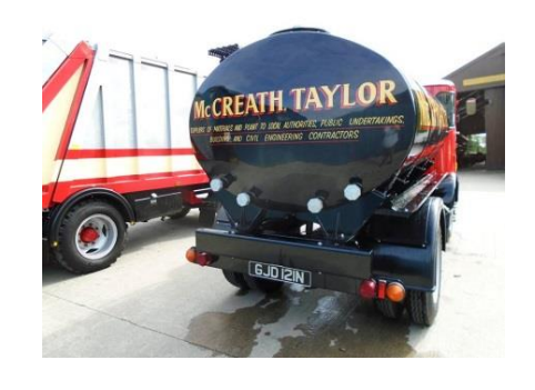
The tanker even looks lovely from behind.