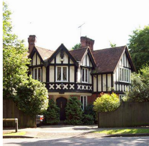
My photo of Melverley from 2009.