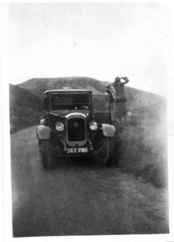
One final photo. Location unknown.