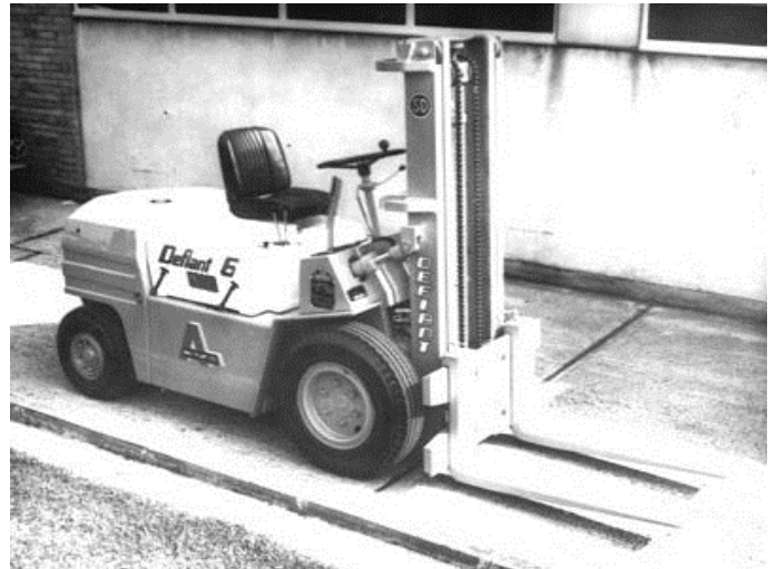
A Defiant 6.

This range was also available with full hydrostatic transmission giving two pedal control. These trucks were designated DH 4, DH 5 and DH 6.