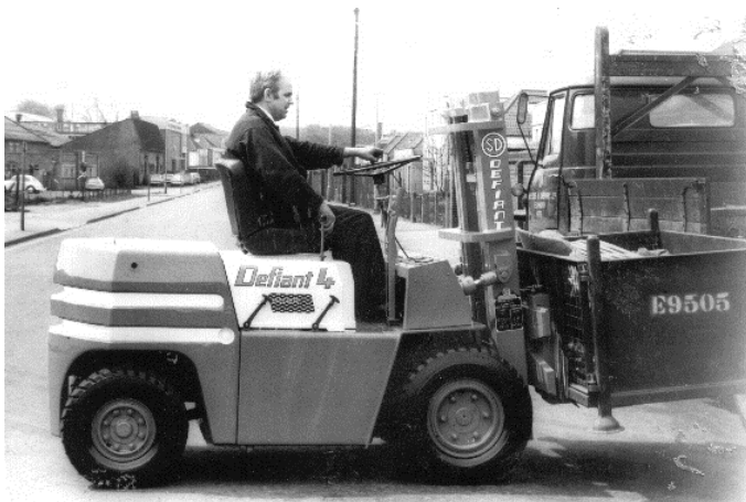
A Defiant 4.

The smallest of the range were the DT 4, the DT 5 and the DT 6. These trucks were powered by a Perkins 4.203 four cylinder 3.33 litre diesel engine, and equipped with torque converter transmission requiring no manual clutch or gear-change.