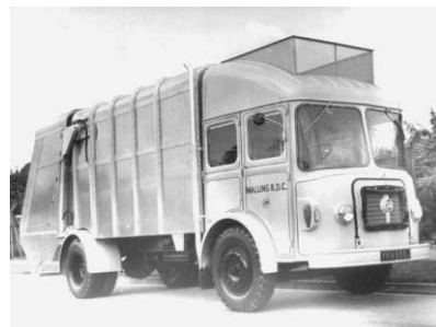
This J Reg TY Revopak for Malling R.D.C. dates from 1970/71