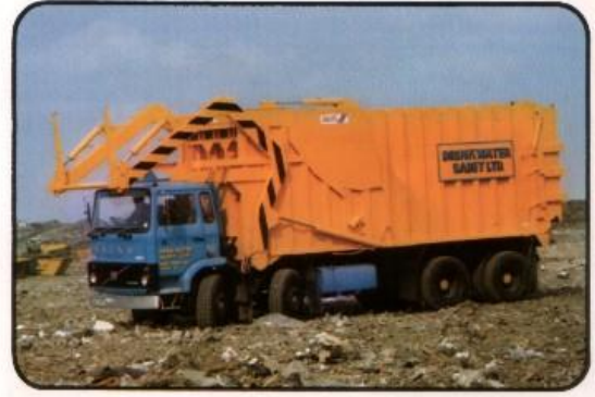
Possibly the first Dempster Dumpmaster FEL.

On 3 rd April 1982 Commercial Motor announced the first Shelvoke Dempster Dumpmaster for Drinkwater Sabey mounted on an 8x4 Volvo F7 chassis of 30 tons gw. Shelvokes were quoting a delivery of three months and a price of around £50,000.00 (£176,500 in today's terms).