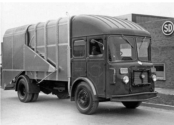
A TY Pakamatic for Tadcaster c 1960

On 28 th October 1960 Commercial Motor Magazine reported on orders obtained by S&D from Rowley Regis, Newcastle-upon-Tyne, and Southall costing between £2,500.00 and £3,400.00 each (Today £ 53,500.00 to £72,760.00) unfortunately no information is given about the type of vehicle. In contrast a Karrier Gamecock for Ipswich was priced at £ 2,292.00 (£49,048.00 today)