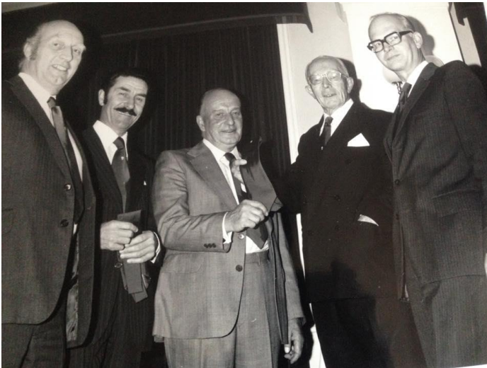
The SD40 Club.